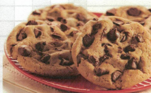
701 Chocolate Chip