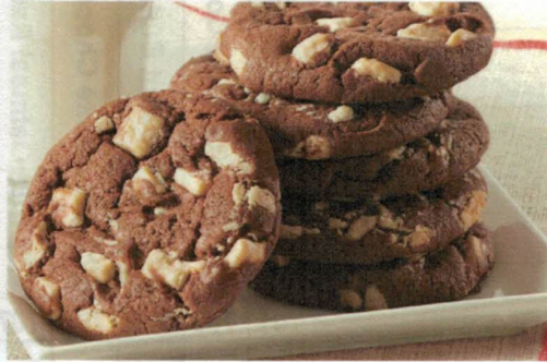
708 Double Chocolate With White Chunk