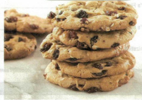
707 Oatmeal Raisin