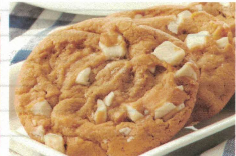
704 White Chocolate Macadamia Nut