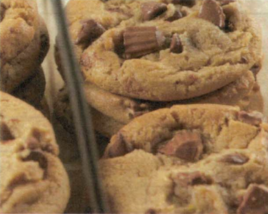
703 Peanut Butter Cup Chocolate Chip